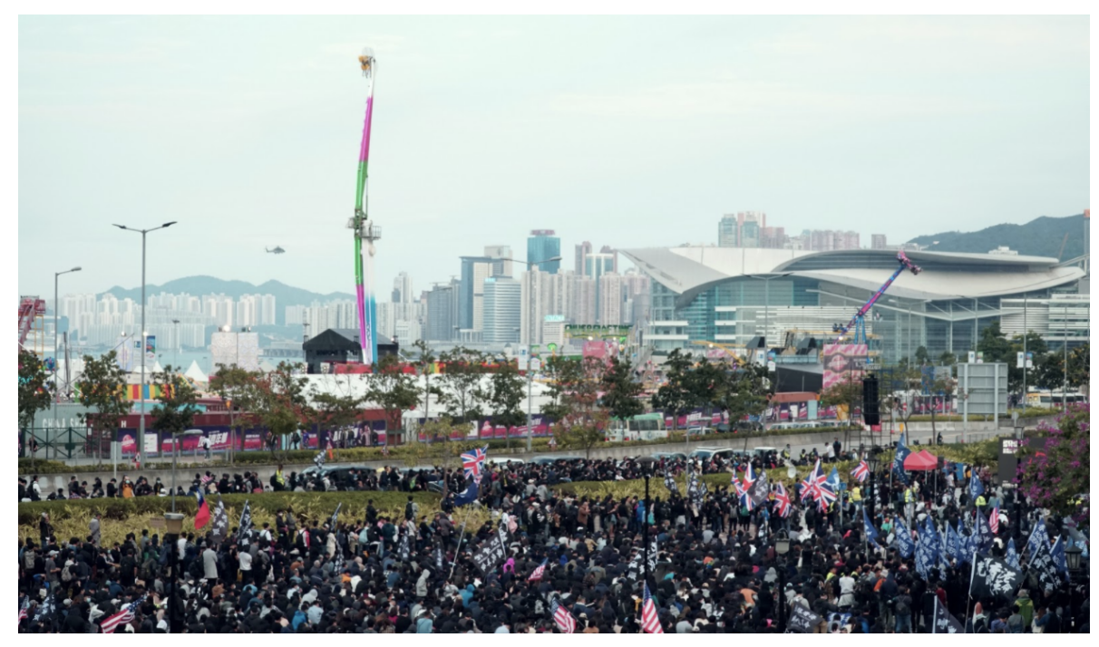
A Chinese military helicopter flies low as protestors hold a peaceful rally calling on the international community to sanction the Hong Kong government.

After seeing police demonstrate that the confiscated "offensive weapons" could burn newspaper, one man raised a copy of People's Daily, the official Chinese Communist newspaper, for others to "burn." As the Star Wars theme played, protest supporters gathered to shine lasers and gasp in mock astonishment at the fully-intact paper. Soon, glow-sticks, disco balls and speakers were brought out as people danced, played party games and projected hand-shadow shows onto the planetarium.