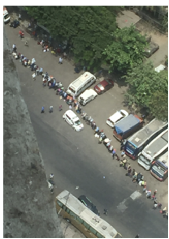
A line of Migrant workers waiting (taken from my window)

In the first months of the coronavirus pandemic, it was termed the great equalizer, because the virus infected people regardless of race, ethnicity, or socioeconomic status. Since then, it has become clear that there is nothing 'equalizing' about this crisis, and the lockdown, Although keeping us safer from coronavirus, the situation has stripped people of their livelihoods and put their health and wellbeing more at risk than ever.