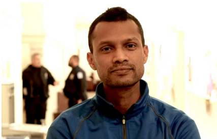
Raiss Tinmaung Human Rights Activist